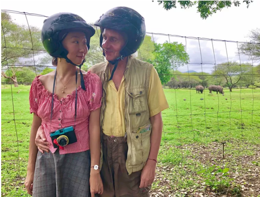
The accomplice adventure, at the Casela zoological park in Mauritius, in January 2020.

I'm excited to be able to vote in the next elections, and... even to be able to present myself! [She laughs.]