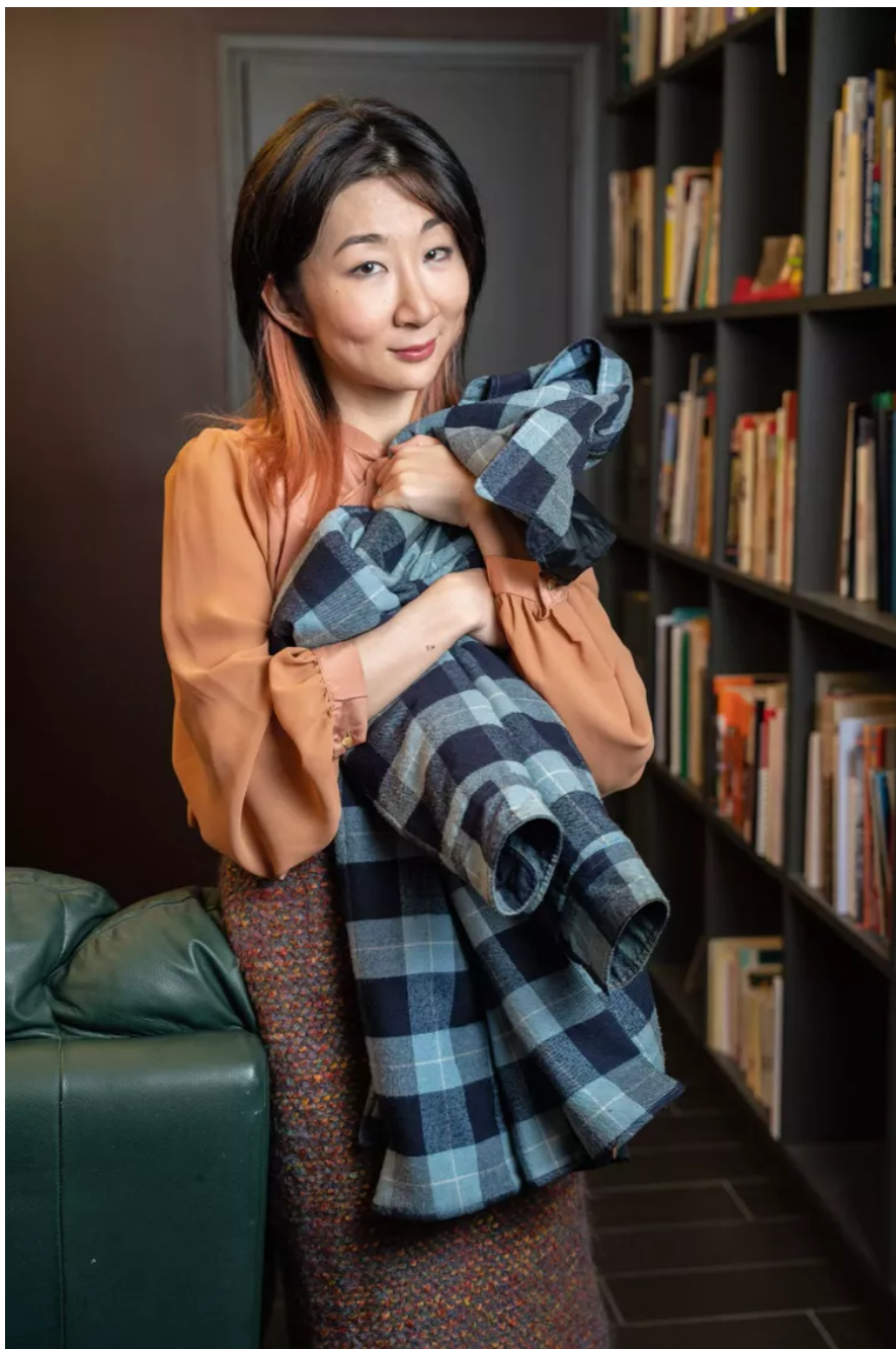
A "Mimi" jacket as a comforter, and a library filled with French books. In his living room, May 9.

At 23, you left everything for a distant country where you didn't know anyone. Where did this courage come from?