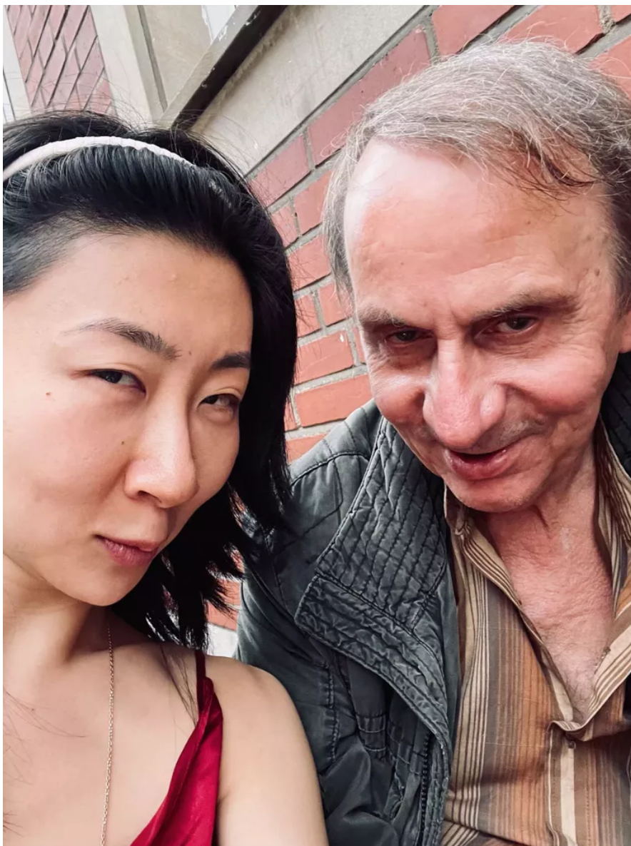
She and her other half. Selfie after a reading of texts by Baudelaire at the University of Münster (Germany), June 24, 2022.

China does not accept dual nationality, so by becoming French, you are stripped of Chinese nationality. Was this choice difficult for you?