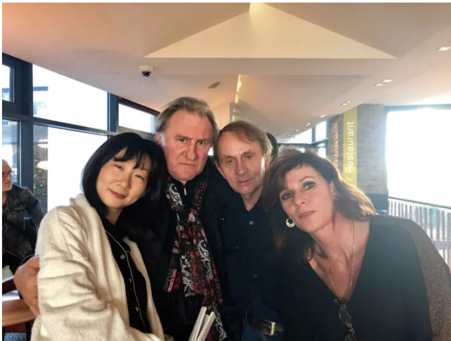
With Gérard Depardieu on the set of "Thalasso", where Michel Houellebecq plays himself. In 2018.