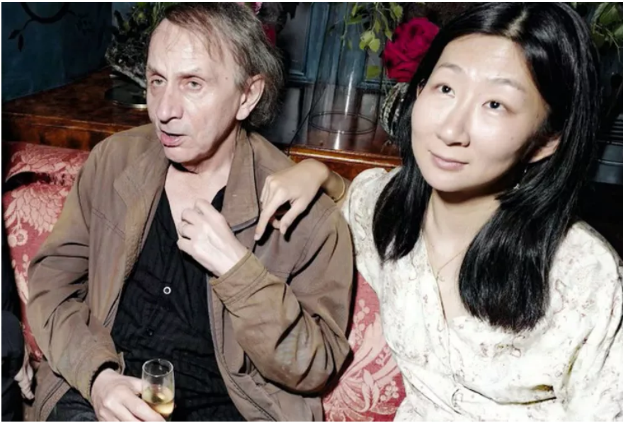
At the reopening party of the illustrious Lapérouse restaurant, in Paris, in 2019.

Last December, Annie Ernaux was delighted in “Le Parisien” to have won the Nobel Prize for Literature against Michel Houellebecq, castigating in passing his ideas which she considers “totally reactionary and anti-feminist”. What do you think ?